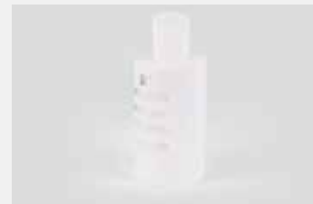
Water Filter T3