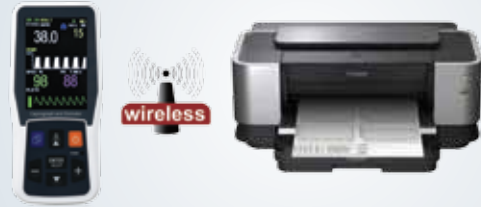
Wireless connection to bluetooth printer