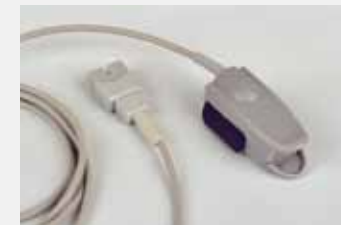
SpO 2 Sensor